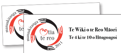
Manaakitanga Bumper Stickers