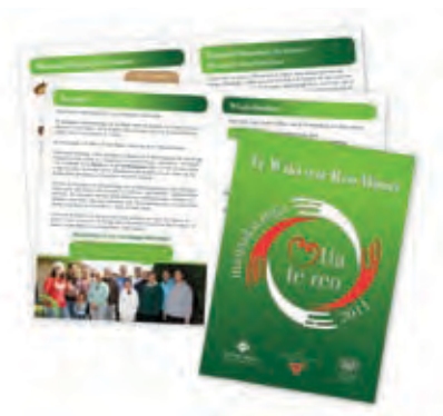
Manaakitanga A6 Phrase Booklets